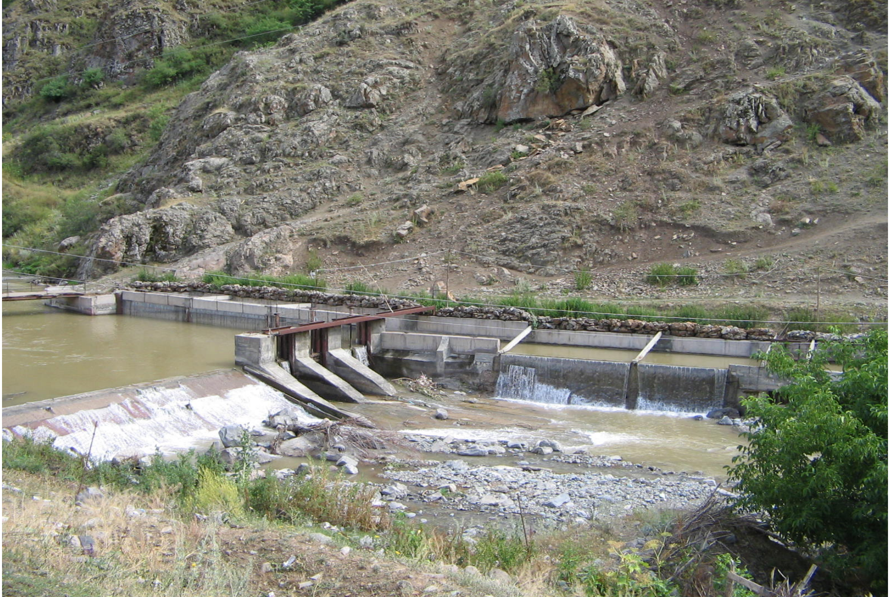
Yeghegis – 1